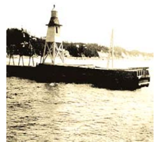
Pentwater South Pier 1914

tion is low except for the appreciation that we can give them for working on our behalf. Thank you all.